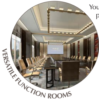
VERSATILE FUNCTION ROOMS

You can choose between eleven versatile function rooms, whether you plan a private meeting with two participants or a large event with up to 500 guests. Two rooms can be divided in the middle and thus add extra flexibility. Or you can use the discrete atmosphere of our Private Dining Rooms.