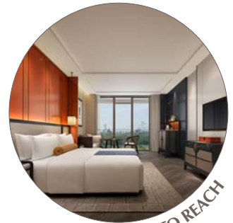
EASY TO REACH

The hotel has an ideal location in the south of Frankfurt, between Frankfurt's city center and the international airport. All major spots can be easily accessed: 10 min - Frankfurt city center | 15 min - Frankfurt airport | 10 min - Frankfurt main train station | 15 min - Frankfurt exhibition center At the hotel, 120 parking spaces are available for our guests.